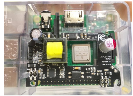
in Canakit case