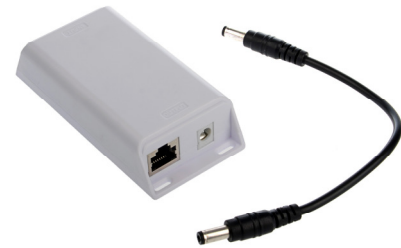
Gigabit PoE splitters for DC, USB and USB-C