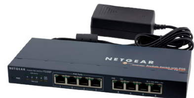
Any PoE Switch