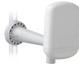
Typical device powered by Passive 24v PoE