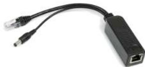
12v and 5v active Splitters for Passive and 802.3af