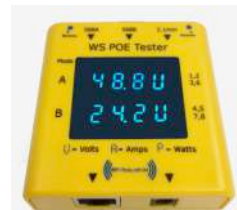
PoE tester to display power/voltages