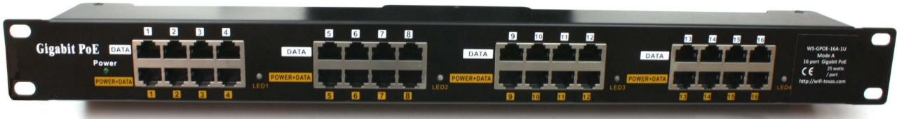
16 Port PoE Injector – gigabit mode A